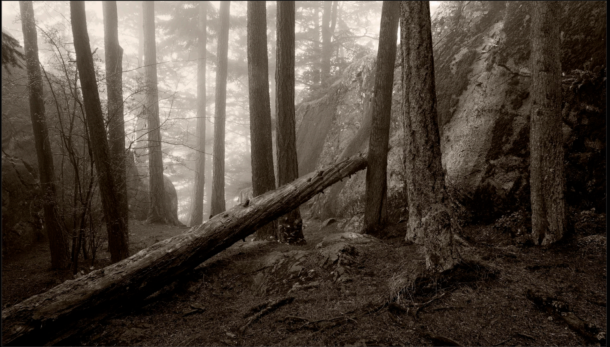
Fallen Log, Rain, Mt. Erie, Fidalgo Island, 2006