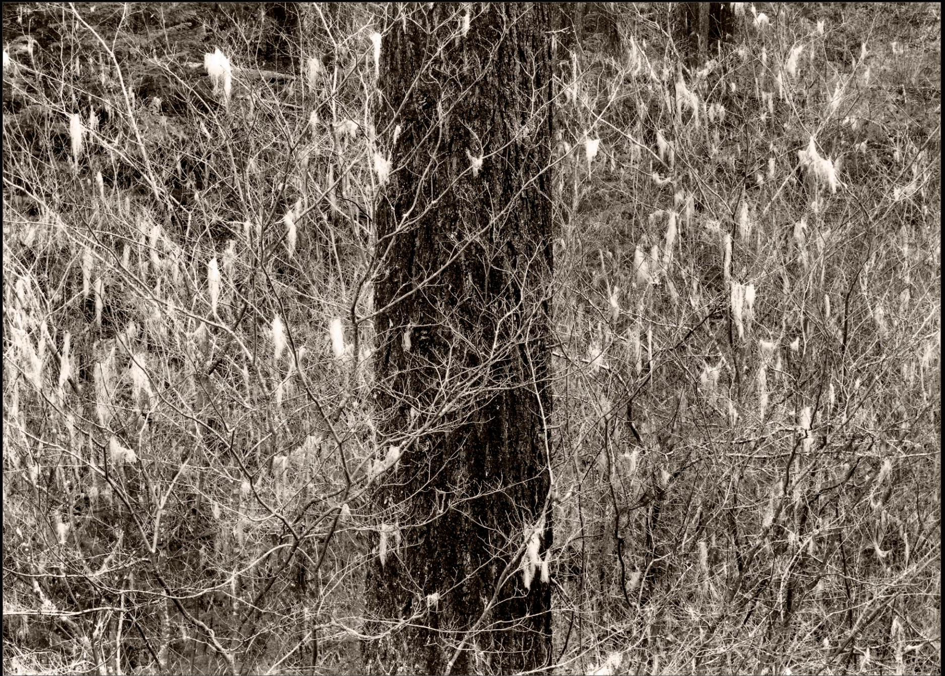
Winter Trees and Moss, Clackamas River, Oregon, 1990