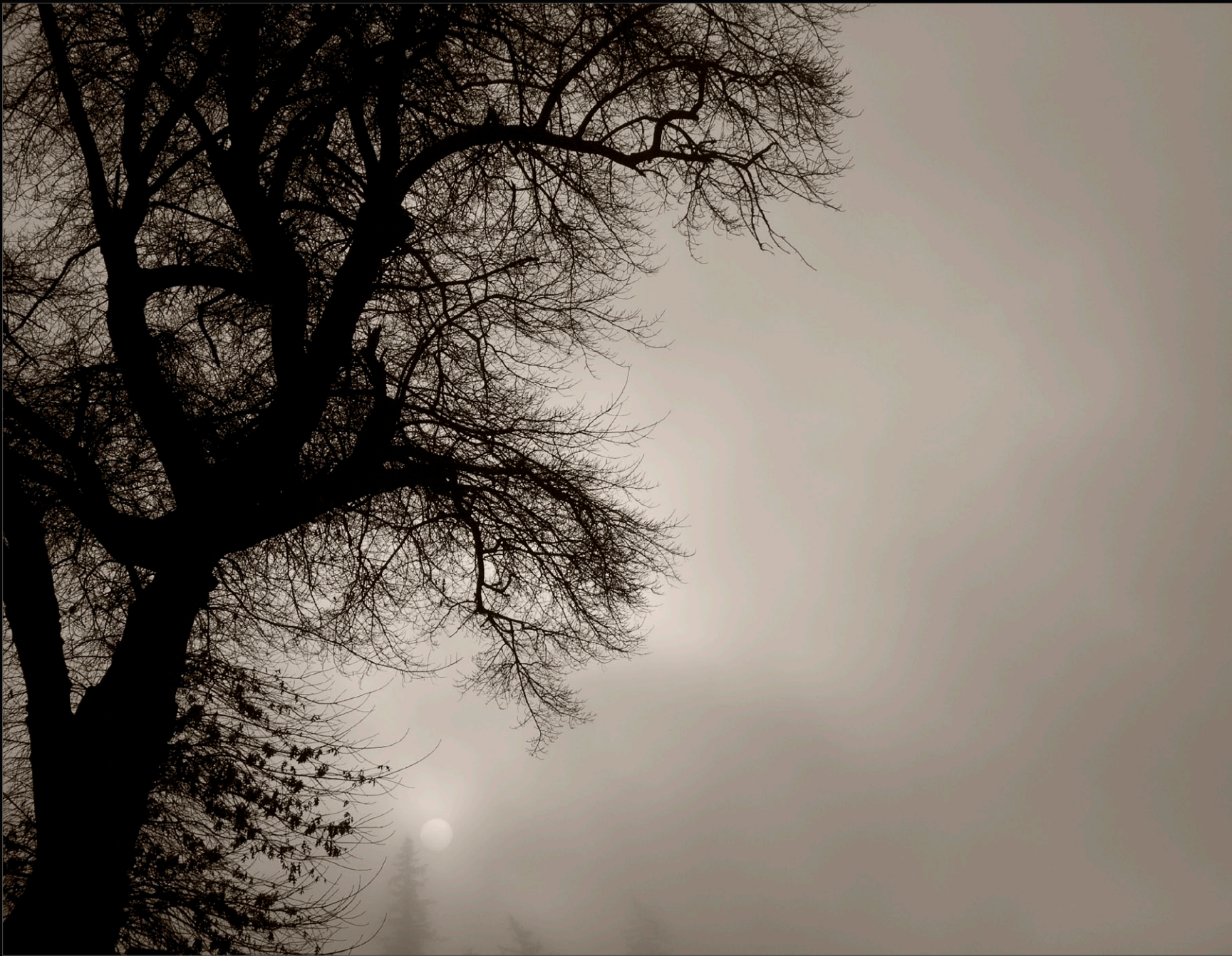
Winter Tree, Fog, and Sun, Mt. Vernon, Washington, 2004