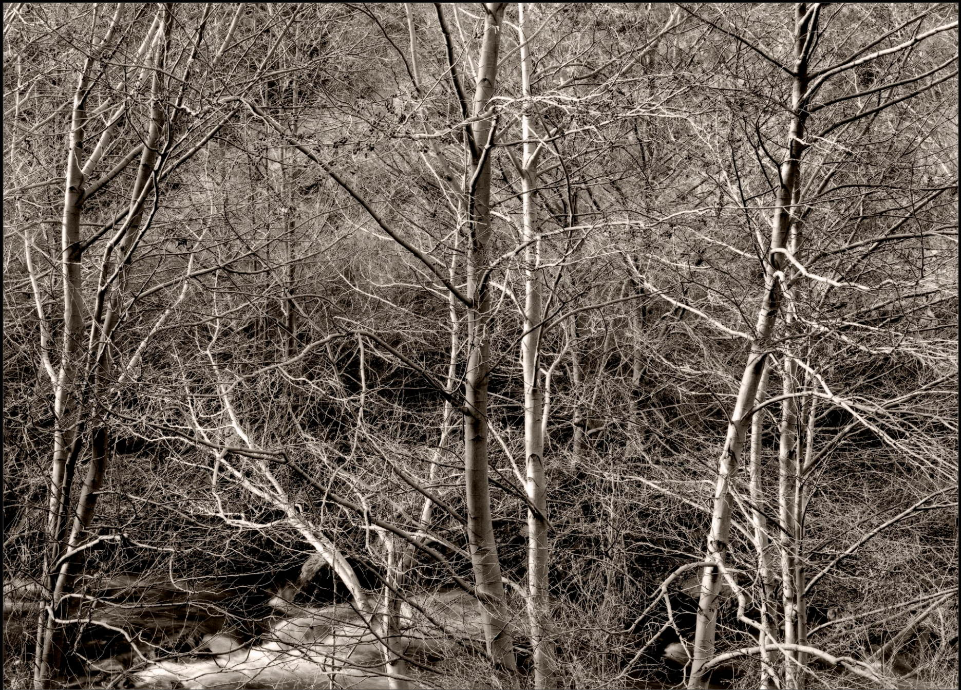
Winter Trees, John Day River, Oregon, 1989