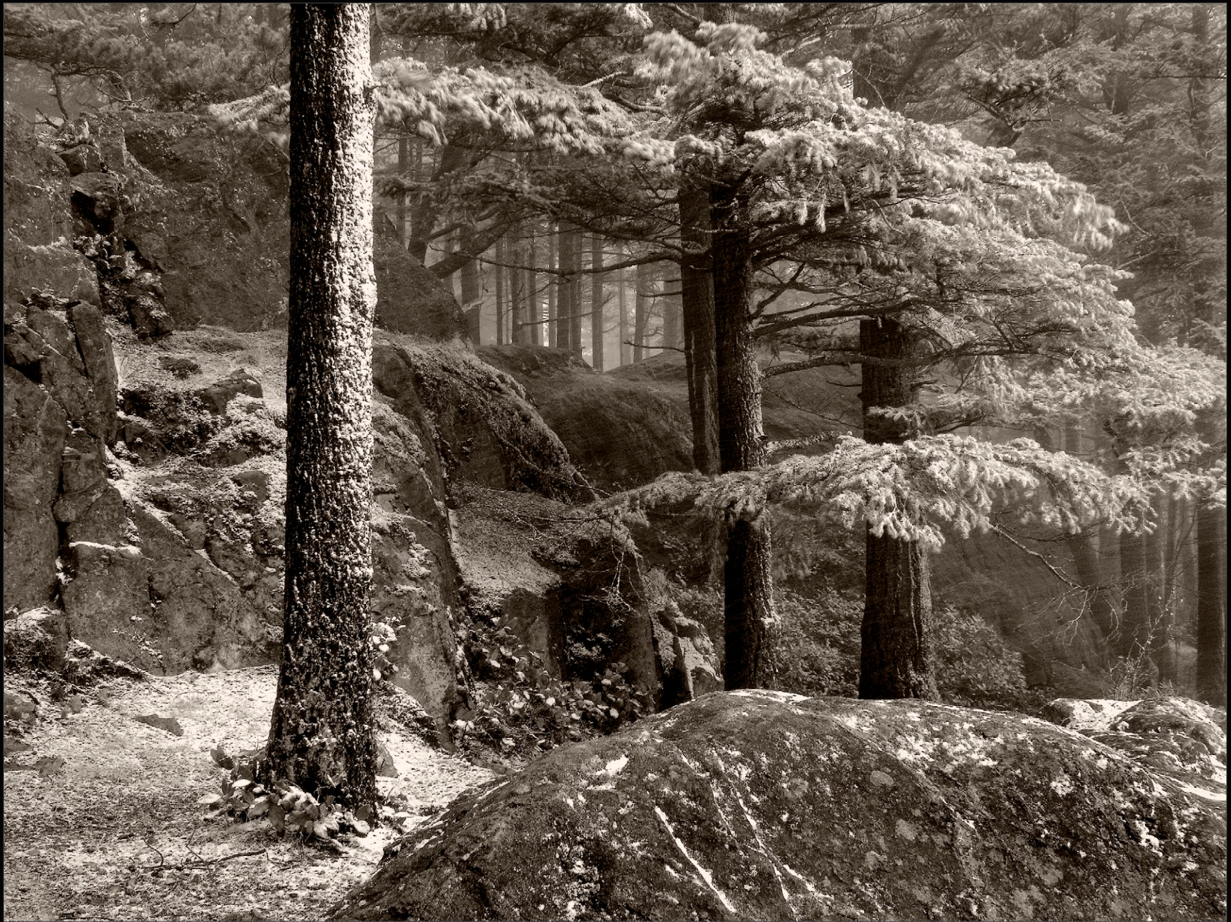
Winter Trees, Mt Erie, Fidalgo Island, Washington, 2003